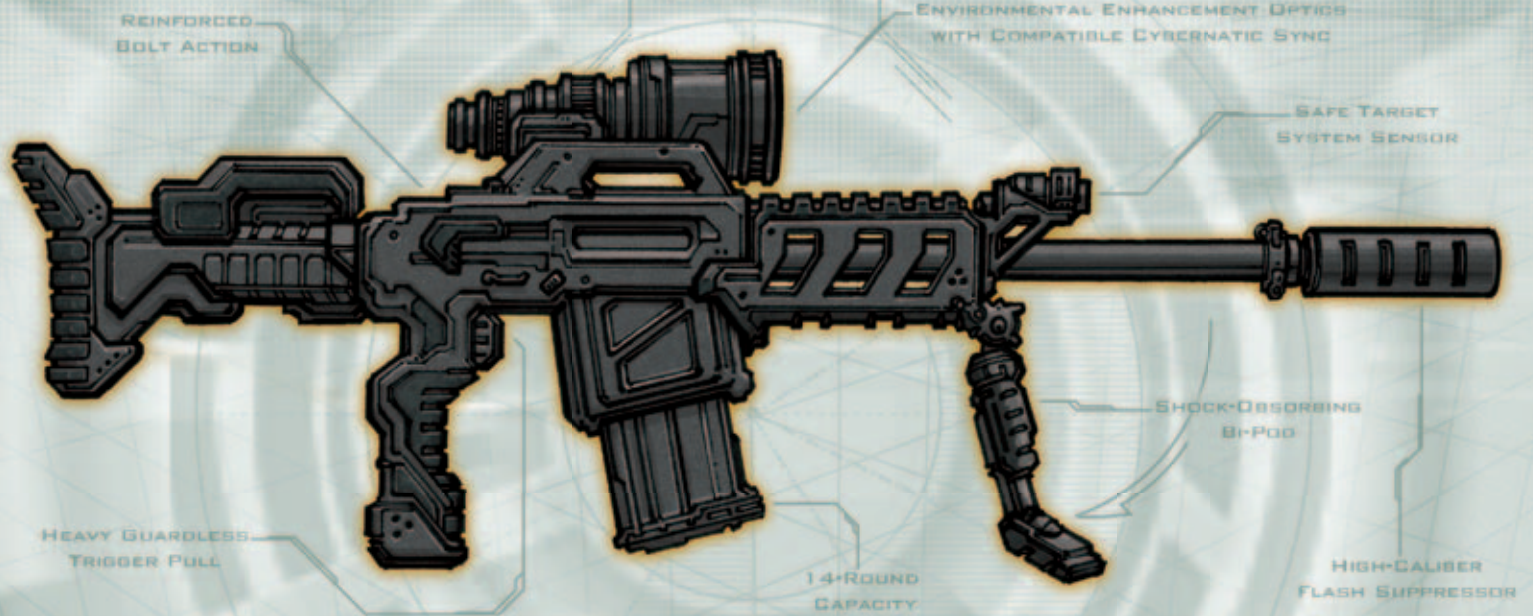
STEYR MINOTAUR ANTI-MATERIAL RIFLE